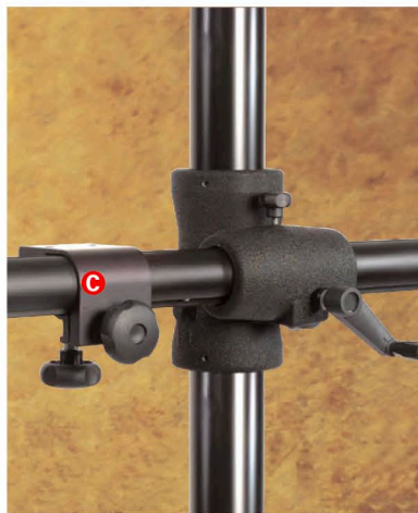
Monostand arm design allows full 360° rotation around the column and 30 cm geared lateral movement